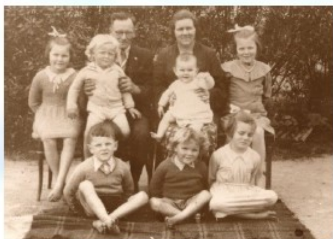
Foale Family, Christmas, 1937