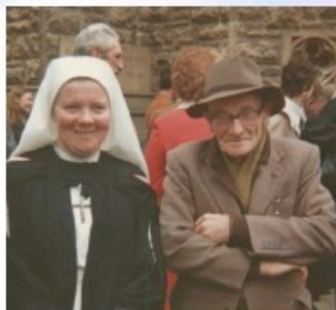
Graduation Day, 1976 with her proud Dad